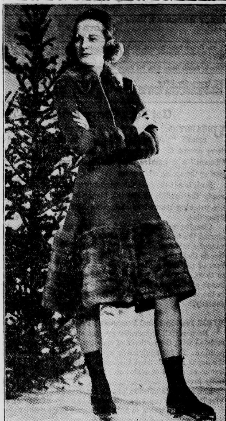
With winter sports taking the front, nothing could be more effective than this royal blue skating costume trimmed with bands of grey squirrel fur. The skirt is full and warm. The top is set off with a clever Peter Pan collar.