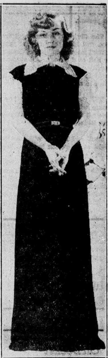
Always popular for evening is the simple black velvet gown. This one is made interesting by its trimming of fine stitched silk braid. Crystal and rhinestone clips fasten at the belt and throat.

gold powder boxes which are crested also will be given the girls.