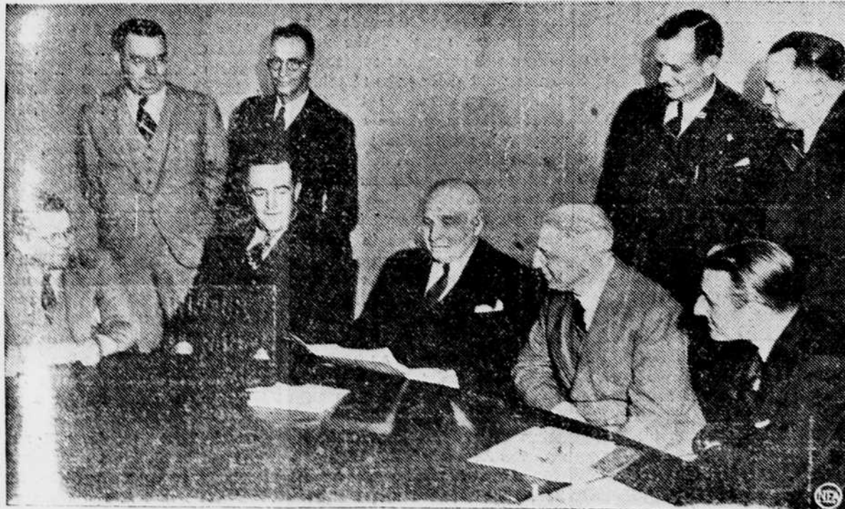
A new peace plan designed to avert further rioting in the Stockton cannery strike was announced yesterday at a conference of labor and cannery officials with peace officers. A conference lead by California Governor Frank F. Merriam, center, to mediate disagreements over wages and hours ended in a complete failure, earlier in the week.