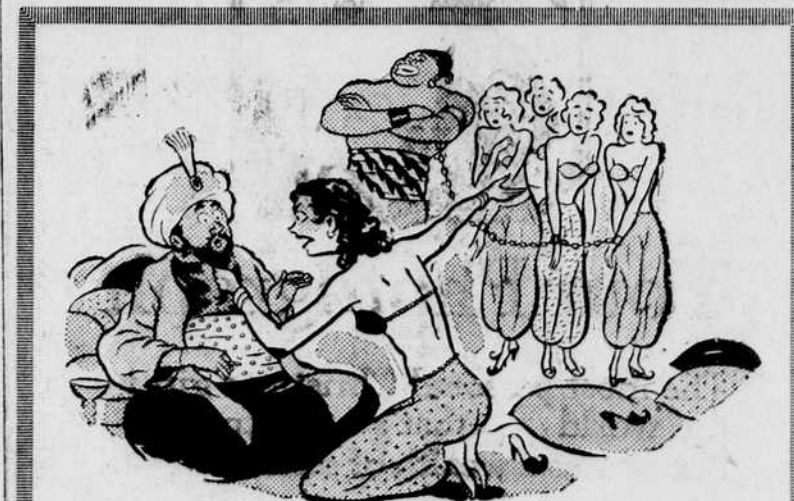
"So that's what you buy with your TWENTY GRAND savings."