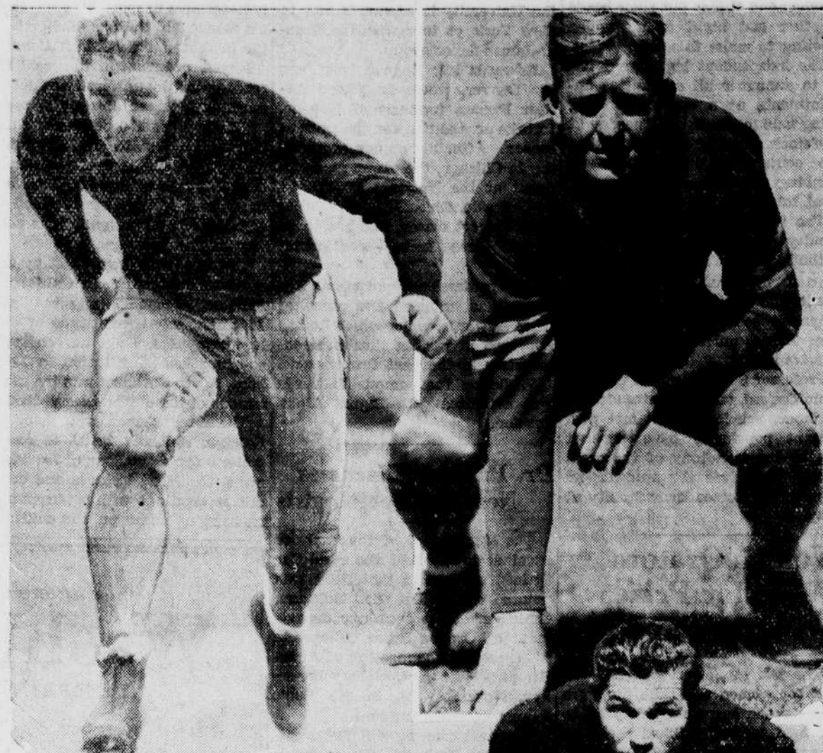
These Four Are Through