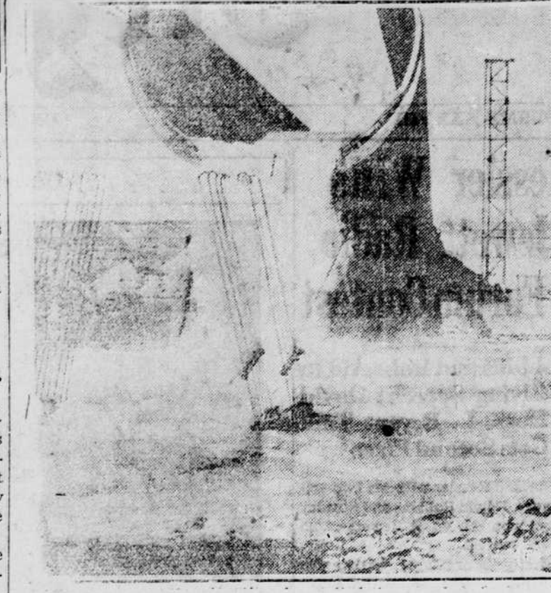
All's fair in war," so loyalists dynamited the aqueduct in Aragon to flood rebel positions in an effort to stem the advance on Madrid.