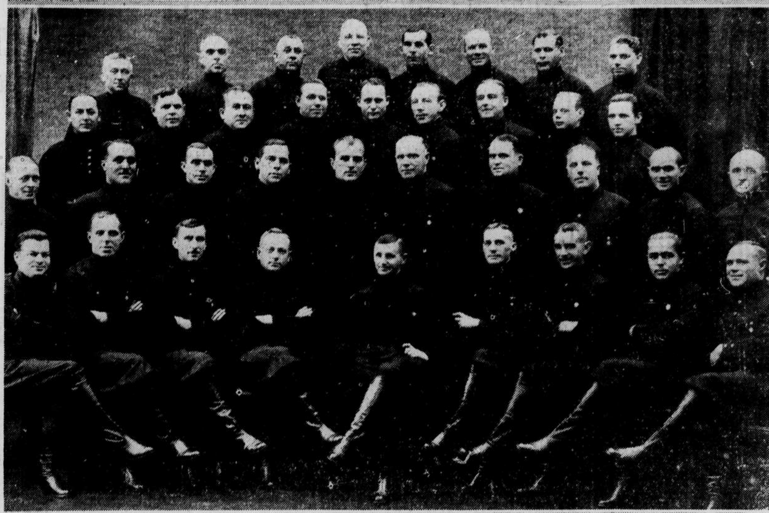
The mighty voices of 36 stalwart warriors will be heard Sunday afternoon in McArthur court when the Don Cossack Russian male chorus opens the University of Oregon concert series. Season ticket sales for the entire ASUO series ends today. The singing horsemen will present an entirely new group of Russian melodies.