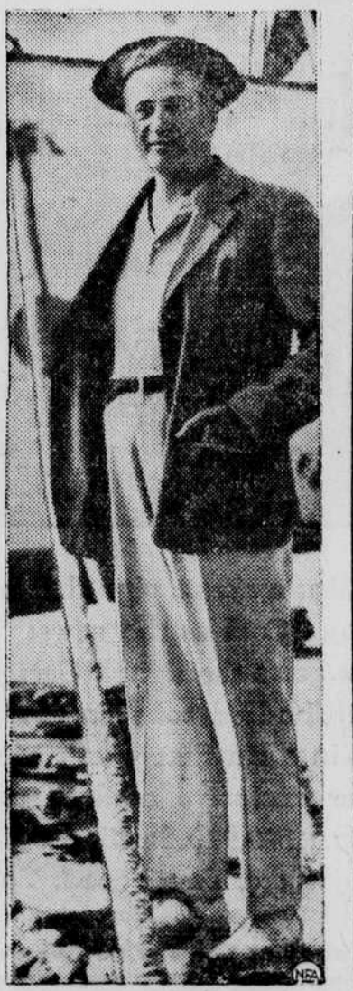
Railroads founded his fortune, but yachts play a close second in the interests of Commodore W. K. Vanderbilt, noted financier and sportsman. Here he is pictured as he supervised work on his yacht at Miami Beach, during his winter vacation.

Yacht Interests Vanderbilt Now Railroads founded his fortune, but yachts play a close second in the interests of Commodore W. K. Vanderbilt, noted financier and sportsman. Here he is pictured as he supervised work on his yacht at Miami Beach, during his winter vacation.