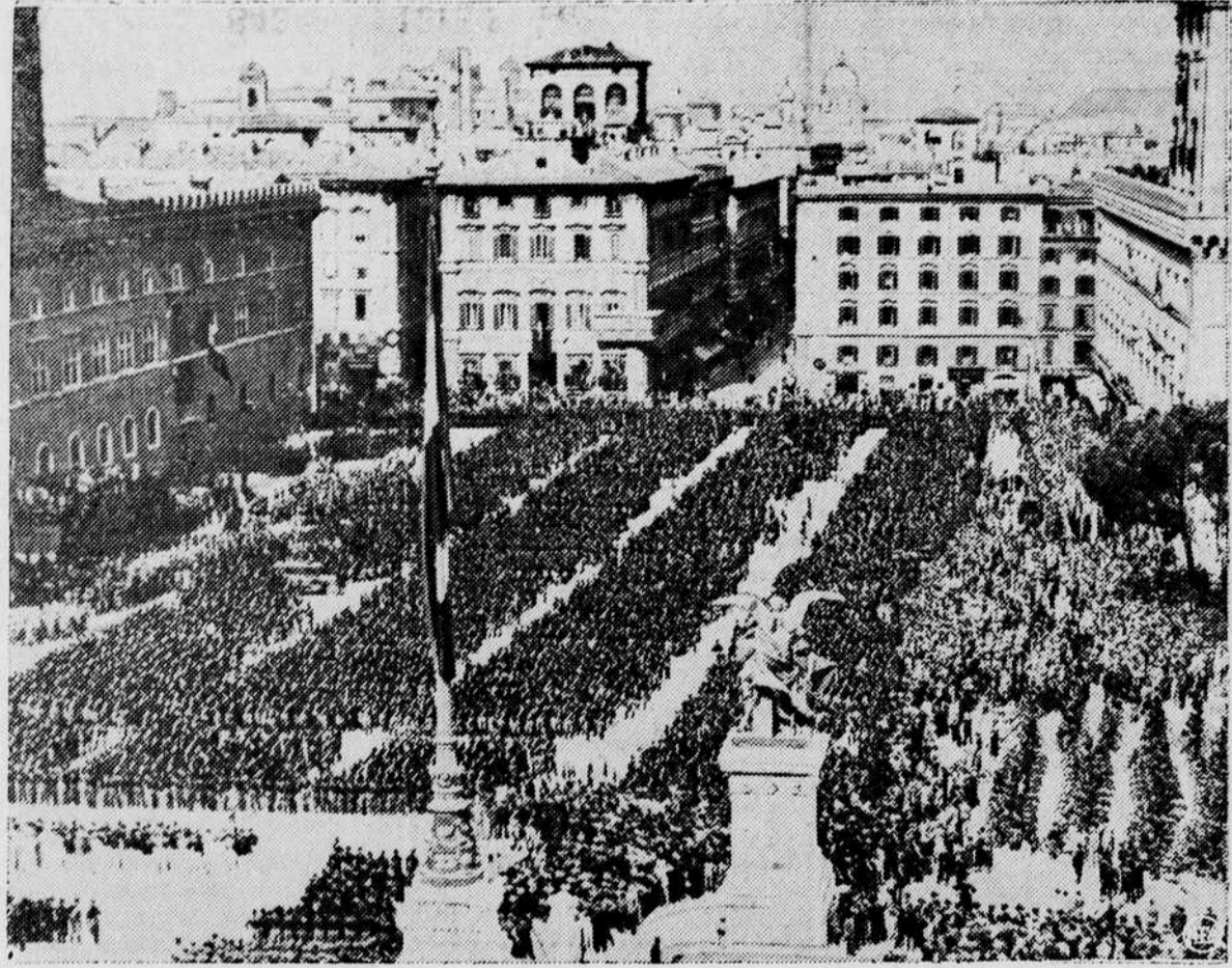
In an impressive demonstration of loyalty to their leader, 30,000 members of the Young Fascist group mass in Rome to celebrate the fifth anniversary of their founding and renew vows to support II Duce.