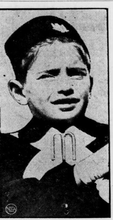
Romano Mussolini, son of Italy's dictator is only 8 but he, like his father, is a fighter and wants to go to Ethiopia like his other brothers and fight for more country.