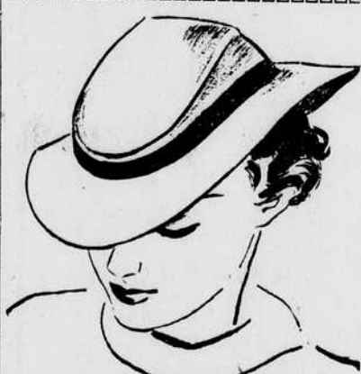
From Freshman to Senior the College woman of 1935 thinks hats.

This year the death knell has been sounded by the gem merchants for the simple elegance of the past few years. More jewelry of an ornamental type, both in the form of separate pieces such as bracelets, necklaces and earrings and in the form of dress accessories such as metal belts and heavy jeweled buttons and buckles are all decreed for the stylish this fall. Earrings are correct for almost any occasion and the girl who doesn't have at least as many sets as she has pairs of shoes will be bemoaning the inadequacy of her wardrobe.