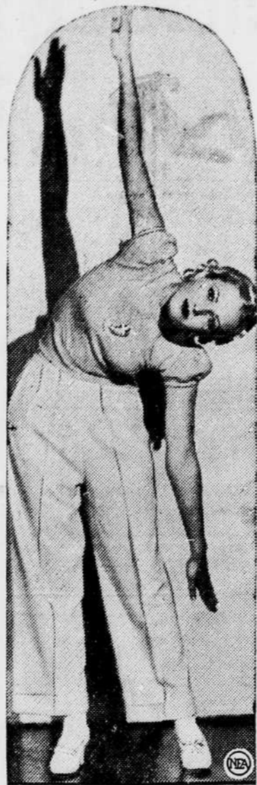
"If you want to keep thin." And so June Lang bends down with a vengeance. The Fox film star's motto is "It's easier to keep thin than reduce."