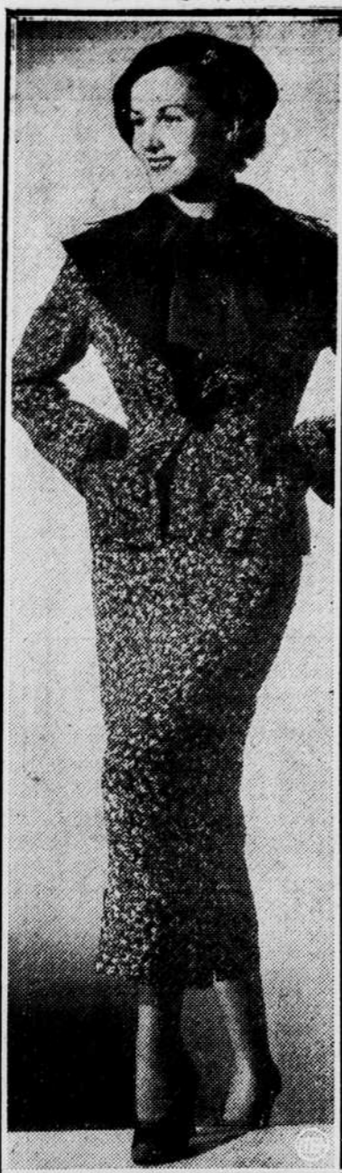
That's the style this year for those who can wear it; and here the coed jaunts to town with a bright flowered print, a navy blue bodice, and a stitched taffeta hat on the side of her head.