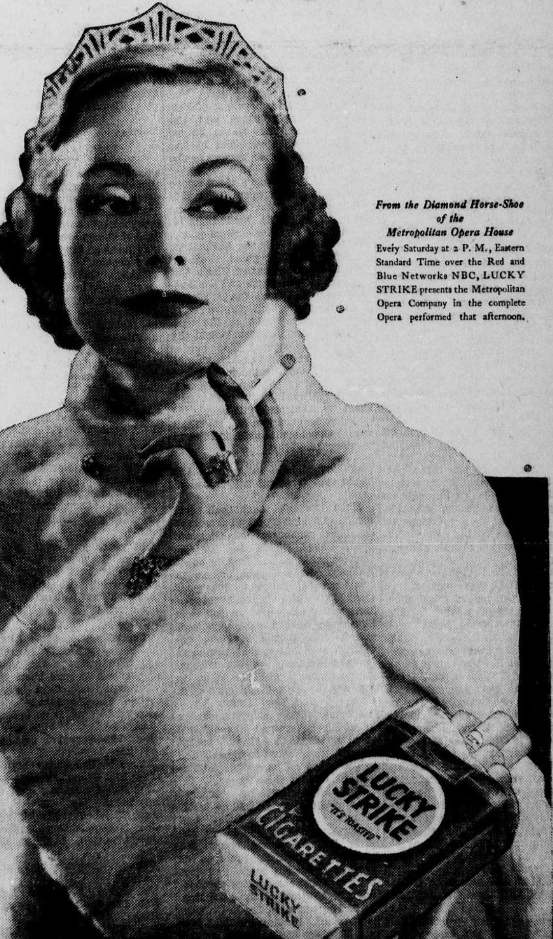
From the Diamond Horse-Shoe of the Metropolitan Opera House Every Saturday at 2 P. M., Eastern Standard Time over the Red and Blue Networks NBC, LUCKY STRIKE presents the Metropolitan Opera Company in the complete Opera performed that afternoon.

Always the Finest Tobacco and only the Center Leaves