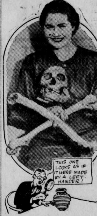
THIS ONE LOOKS AS IF IT WERE MADE BY A LEFT-HANDER!