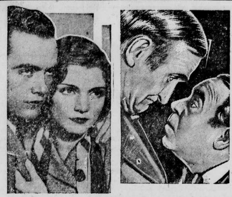
Left, Peggy Shannon and Charles Rogers in "This Reckless Age" at the Colonial today and tomorrow. Right, George Sidney and Charlie Murray in "The Cohens and Kellys in Hollywood," at the McDonald.

CHRONICLING WHAT'S HERE AND WHAT'S COMING