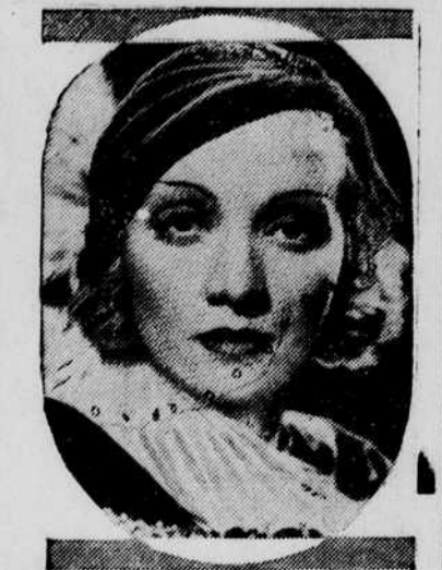
Marlene Dietrich, in her new picture, "Shanghai Express," which comes to the McDonald Sunday for three days.