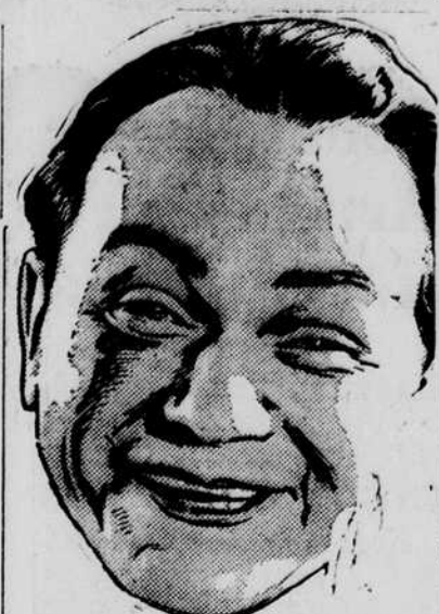
Edward G. Robinson, who co-stars with James Cagney, in "Smart Money," coming to the Colonial Sunday.

It is impossible to say that "The Passionate Plumber," has a legitimate plot, but a few incidents might be stated. Keaton wrecks a car and has to sign his love away to pay for it. He literally becomes an orthodox gigolo, one who makes love to women so that other men will love them better. A duel between Keaton and a jealous suitor proves to be hilariously funny, also another ridiculous note is struck when Buster is seen straining on