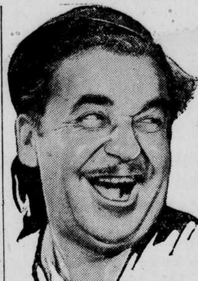
per in "Shankhaied Love" at the Heilig theatre for 3 days starting

The films will be rushed by plane music day. Eugene Pearson, bari-An invitation has been extended the first polyphonic choir, the