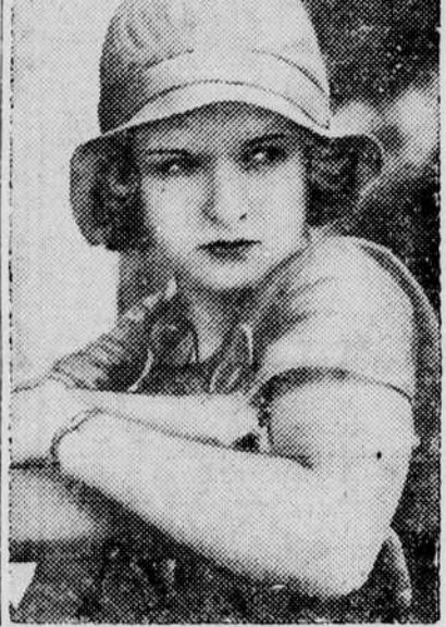
Joan Bennett in "Maybe It's Love"

All-American Team at Heilig Featuring the All-American team for 1929, "Maybe It's Love," opens at the Heilig Sunday for a three-day run. It is romance of college days, with a cast headed by Joan Bennett, Joe Brown and James Hall. A fast moving story of campus life, it presents an authentic picture of undergraduate days. Miss Bennett portrays a college belle, and Joe Brown has the