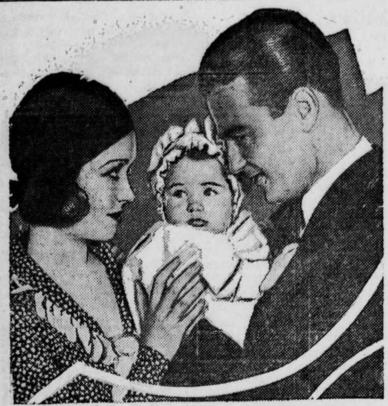
Constance Bennett in a scene from "Common Clay."