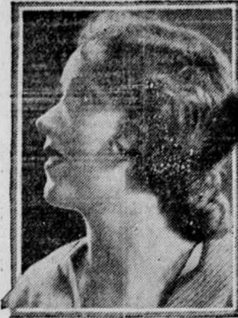
FAY WRAY At Colonial

"The Border Legion," a truly You'll want a 'mum for the game.—Adv.