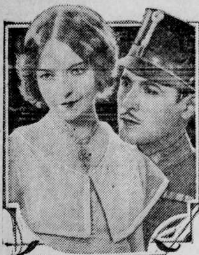
LILLIAN GISH and ROD LAROCQUE At McDonald