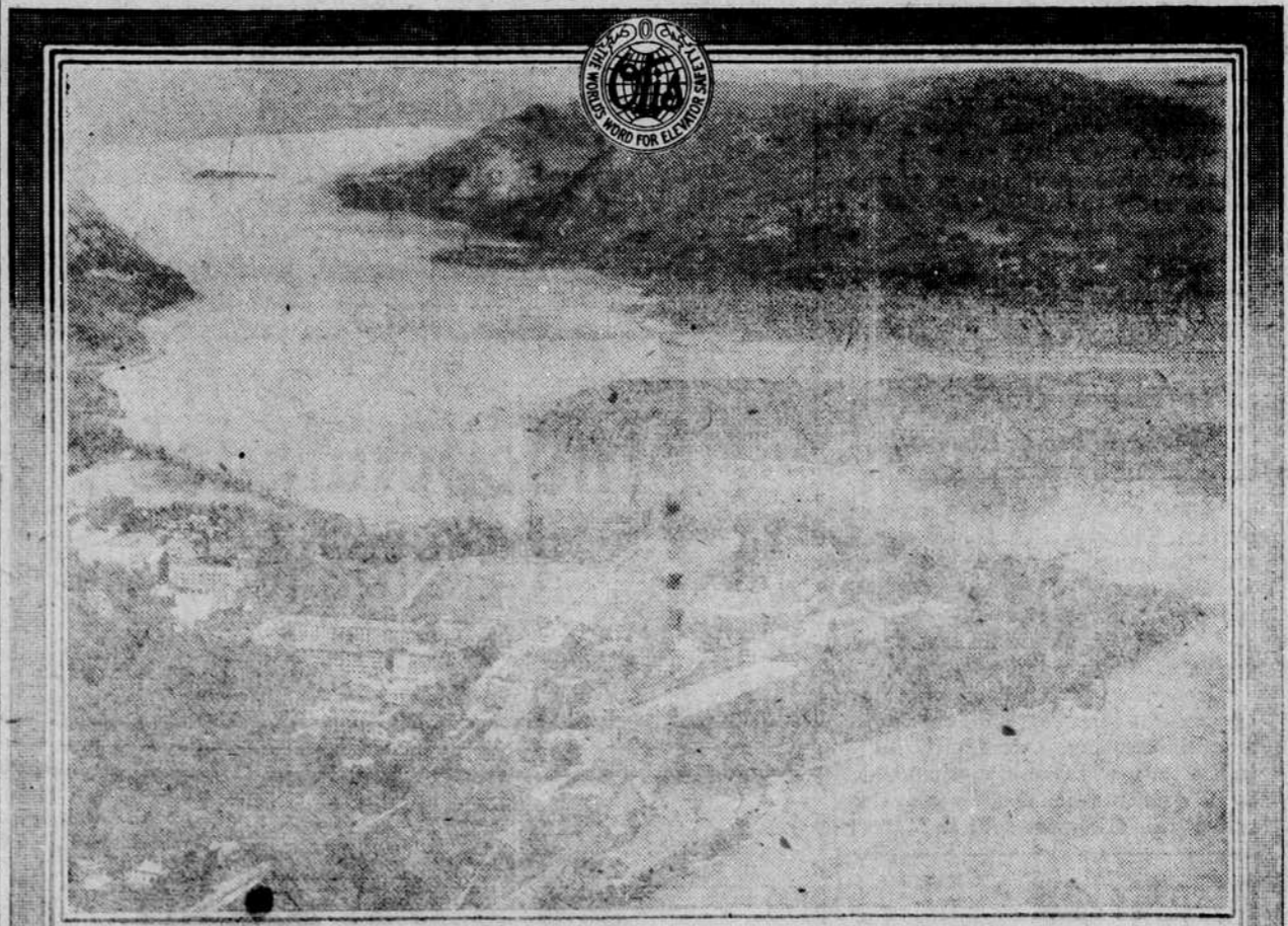
General view of the United States Military Academy, West Point, N. Y.

PROBABLY no single spot in this country is more widely known than West Point, where our future army commanders receive their education and training in the arts of war.