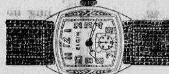
Man's handsome strap watch... the Elgin Legionnaire. $21.50. Sturdy strap watches, to suit every man's taste... $19 to $100.

and varied. We'll know what He will like... and chances are, have a variety of desirable presents from the newest ELGIN Watch models for men to the newest style of belt buckle, here for you to choose from.