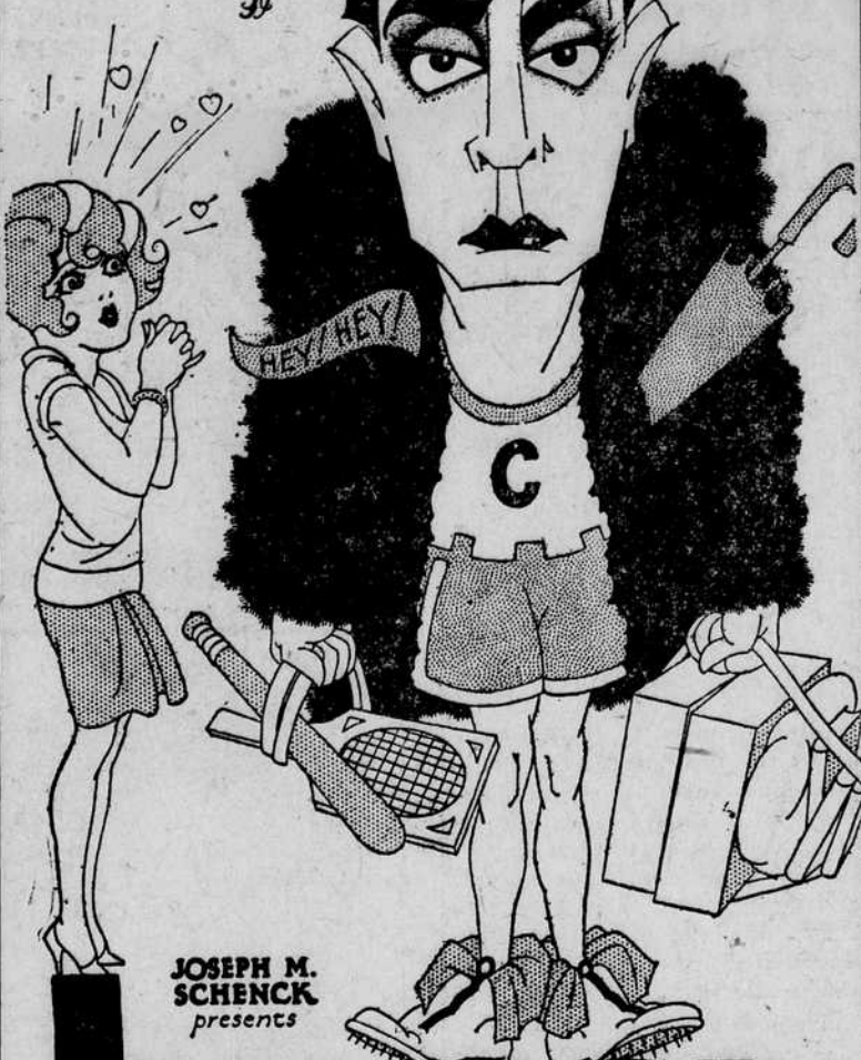
JOSEPH M. SCHENCK presents