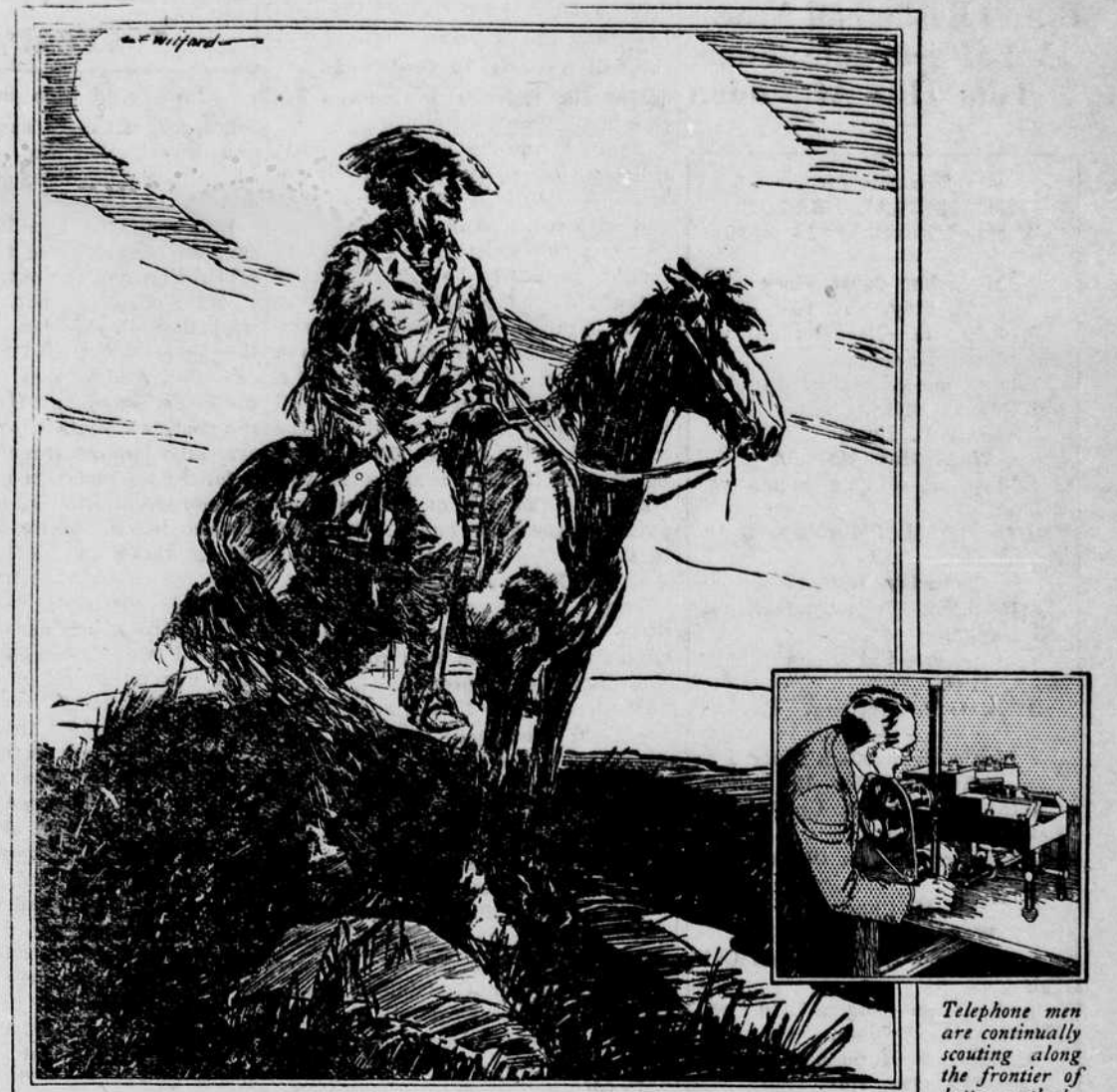
Telephone men are continually scouting along the frontier of better methods.