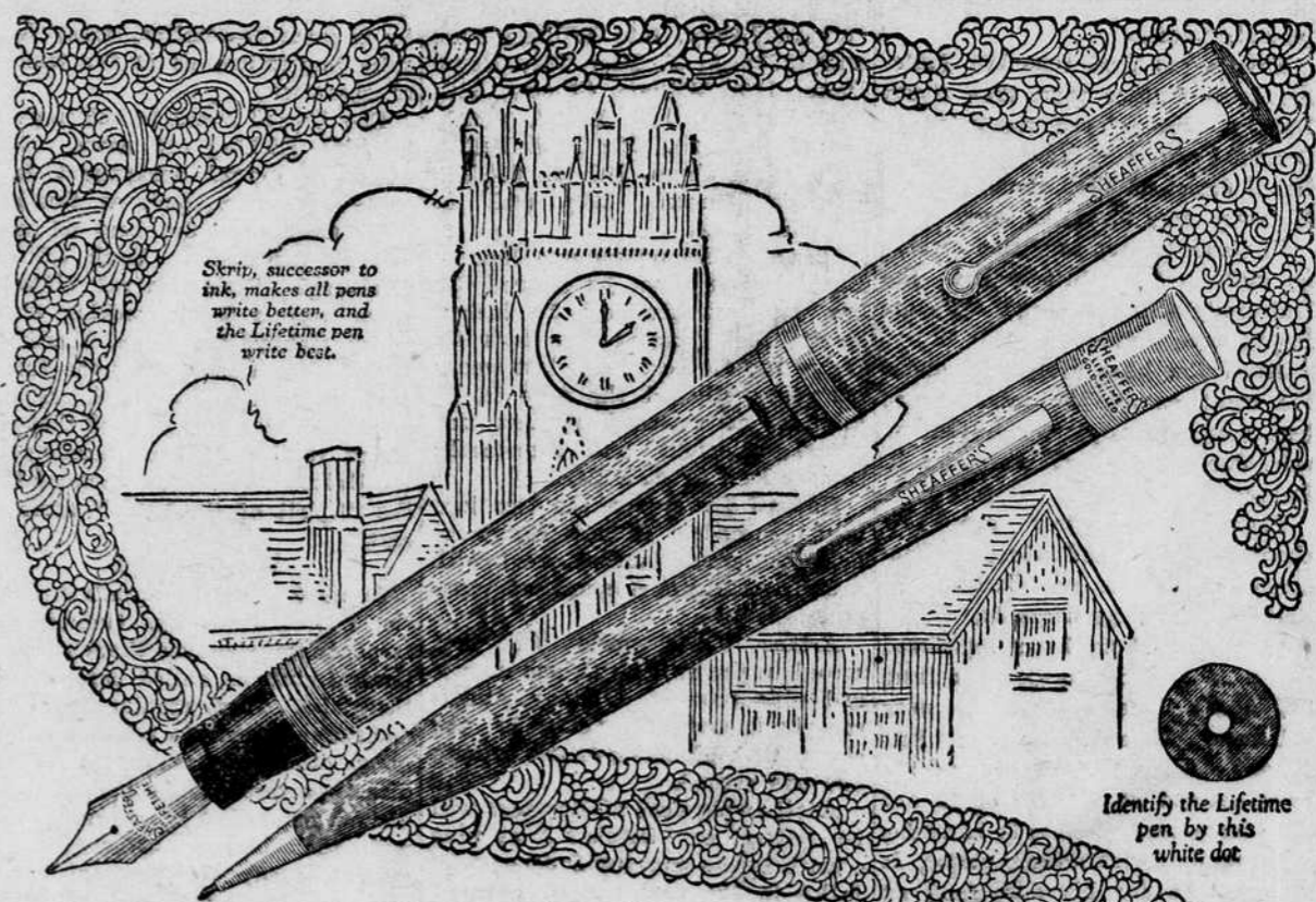
Skrip, successor to ink, makes all pens write better, and the Lifetime pen write best.