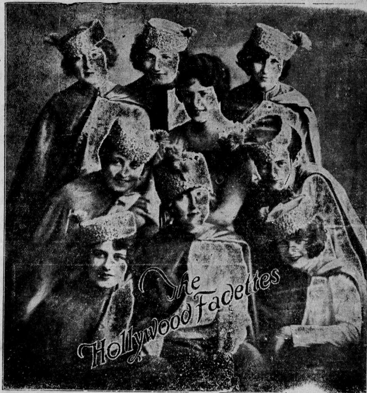
A ladies' singing band direct from Hollywood, California. All artists—singers, dancers—beauty contest winners, radio favorites.

Featuring the Hollywood Fadettes A Night of Hollywood Life