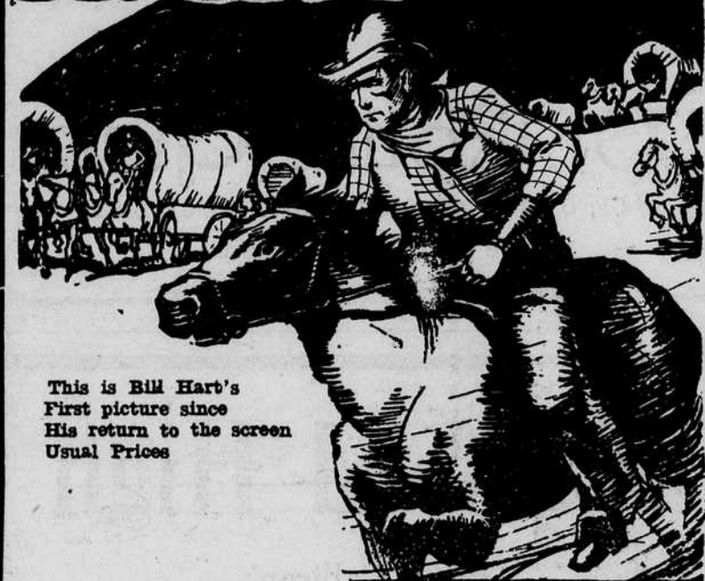
This is Bill Hart's first picture since his return to the screen. Usual Prices