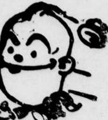
YELL LEADERS IN