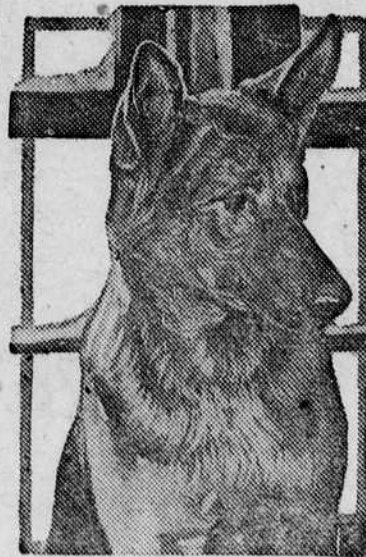
PETER THE GREAT "WILD JUSTICE"