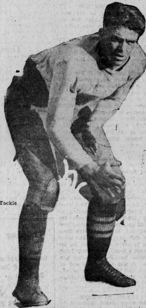
HOMECOMING PROGRAM TODAY

All Day Alumni Registration 7:00 P. M. Pajamarino, starting from "O" 8:00 P. M. Bonfire, on Kincaid Field 8:30 P. M. Rally, at Woman's Building 10:00 Alumni Smoker at Men's Gym