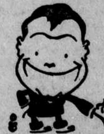
Obak Wallace, Head of the Alumni Smoker

on Friday evening and will be held in the Banquet Hall on the second floor of Obaks Hall. A delightful program has been arranged for the old grads who will be back and expecting a real evening. One of the features of the evening will be a snooker match between Stan Speigle and Campbell Church. These two men have been practicing several weeks and it is hinted that this will be a grudge match.