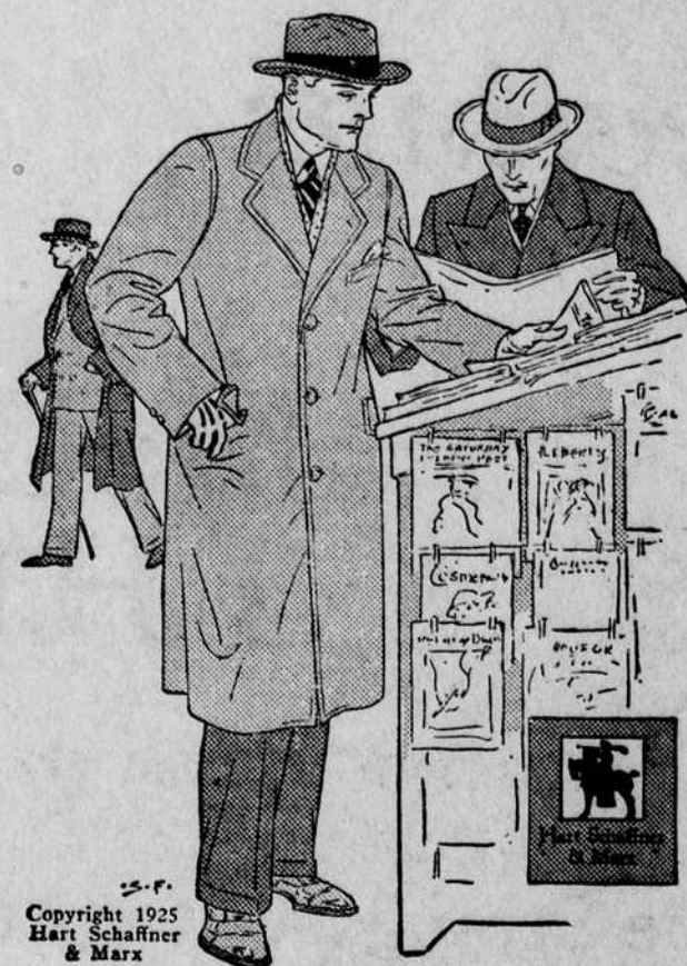
Copyright 1925 Hart Schaffner & Marx

These are the styles that have the college man's O. K. for fall