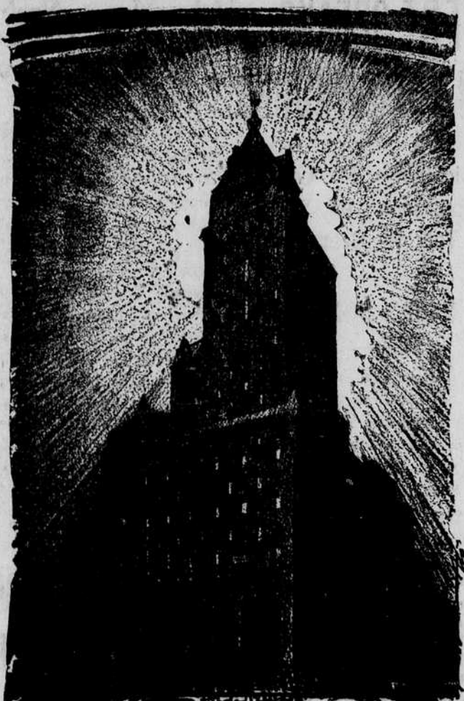
The Hecker Building, New York City Warren & Wetmore, Architects