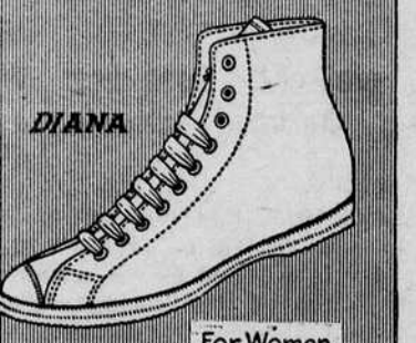
For Women and Girls