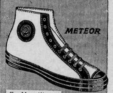
For Men, Women, Boys and Girls