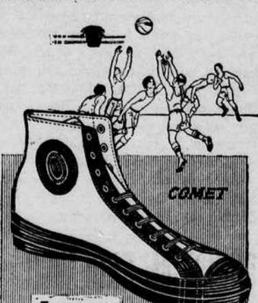
For Men and Boys

Phone Reservations to 141 or Jack Myers, 127