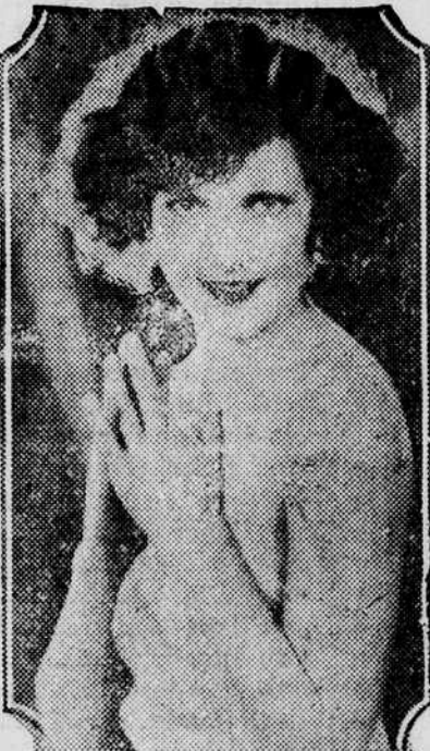
JEAN ARTHUR in "CAMEO KIRBY" Special Production—WILLIAM FOX