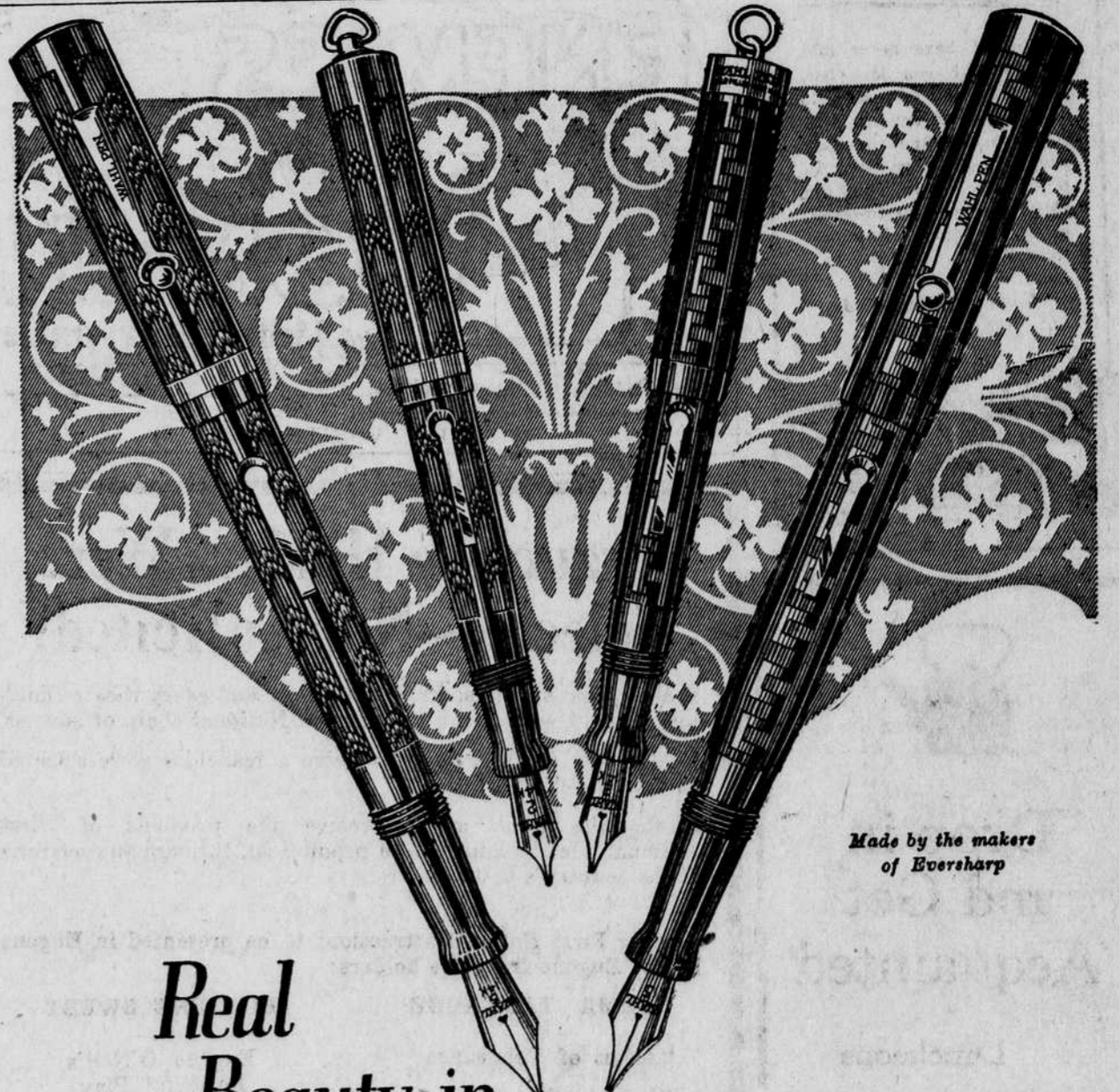
Made by the makers of Eversharp