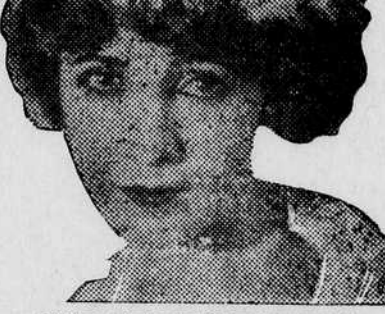
ONE OF THE FAMOUS FACES IN

Marshall Neilan's Supreme achievement The Strangers' with Banquet 23 Famous Stars