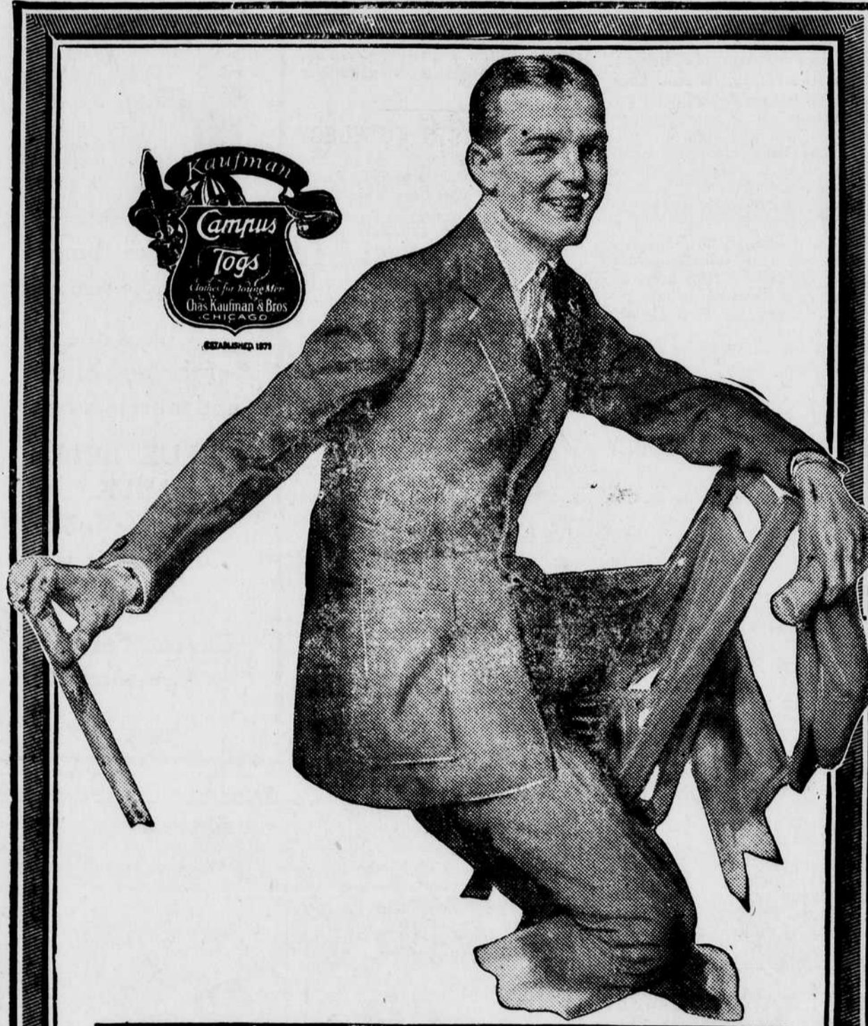
—Clothes Designed by Kaufman