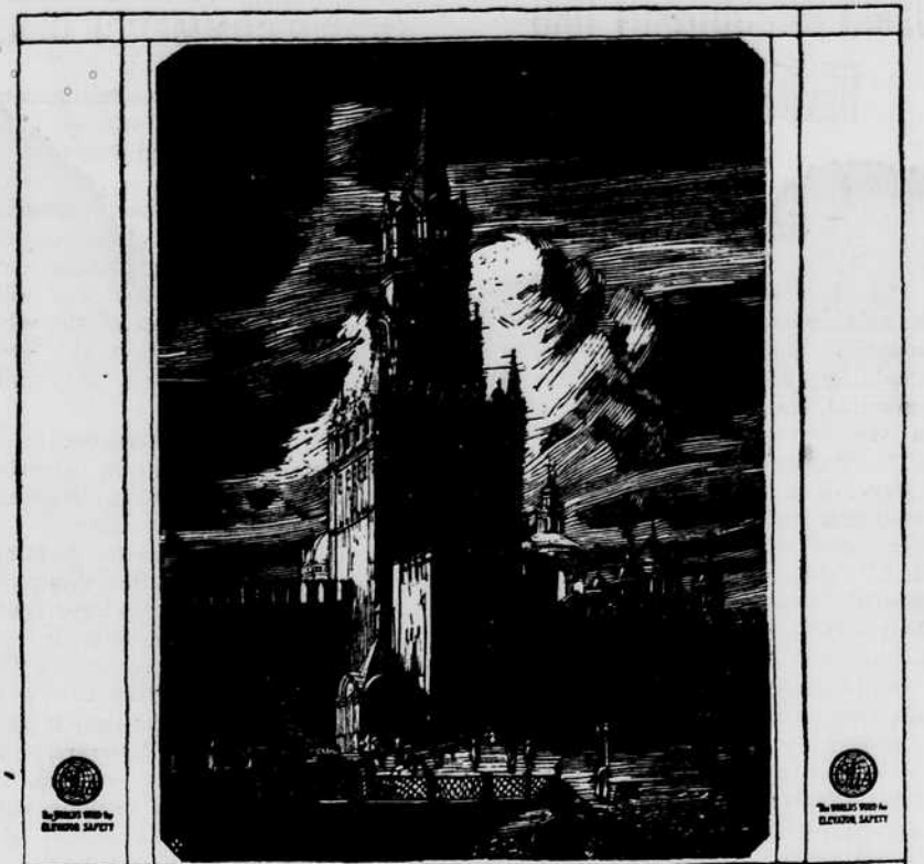
THE KREMLIN, MOSCOW Most of the famous buildings of the world are equipped with Otis Elevators

THE KREMLIN is the citadel of Moscow. The walls of the triangular enclosure were built in the year that Columbus discovered America. Much of the history of Russia—a dark tale of intrigue, mystery and bloodshed—was enacted in the Kremlin buildings.