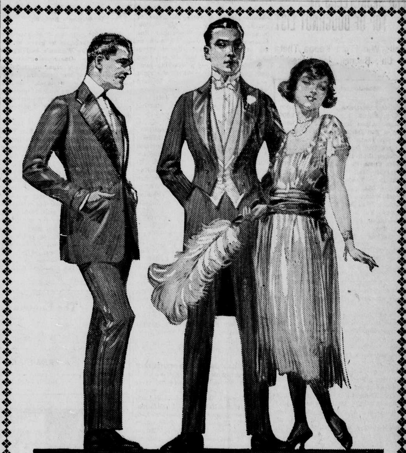
Copyright 1921 Hart Schaffner & Marx

This is the BANJO ERA Vega Banjos Try one and you will Buy one Eugene Music Shop 8 East Ninth Street Headquarters for everything Musical