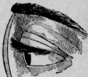
Moody's Toric Lenses are best