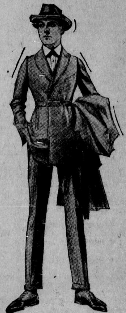
Copyright 1919, Hart Schaffner & Marx

New shipments of fine all-wool clothes are coming to us every day from Hart Schaffner & Marx. They're the kind of clothes you ought to have. If we haven't your size today, we'll have it a little later—such quality is worth waiting for.