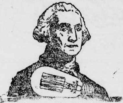
George Washington and His Gallant Soldiers Preserved Liberty for Our Country.

Retain and preserve your sight by providing plenty of good light made with NATIONAL MAZDA LAMPS.