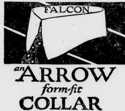
FALCON an ARROW form-fit COLLAR