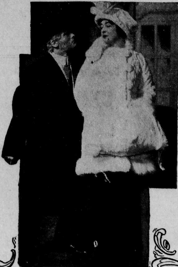
LEARNING THAT THE MYSTERIOUS WOMAN IN "SEVEN KEYS TO BALDPATE" HAS CLAIMED TO BE HIS WIFE, THE RAILROAD PRESIDENT DEMANDS AN EXPLANATION.

Daily Excursion Fares to California Expositions via the North Bank Rail and Twenty-six Hours Ocean Sail on the Palaces of the Pacific