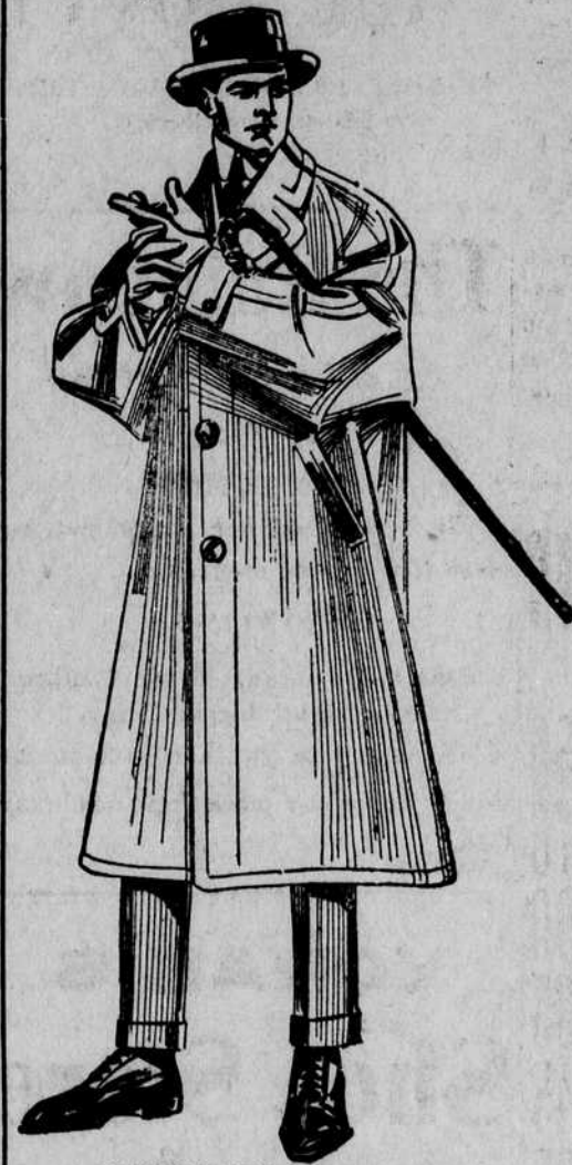
COPYRIGHT 1914 THE HOUSE OF KUPPENHEIMER

Try on our stock models and let us explain the possibilities that can be accomplished with a make to measure line handled in connection with our Kuppenheimer line in stock.