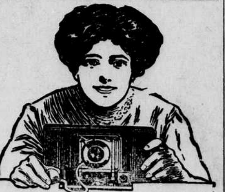
Copying and Lantern Slides.