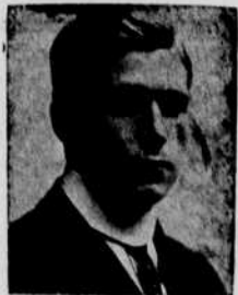
Playing in "A Strenuous Life" Saturday Night