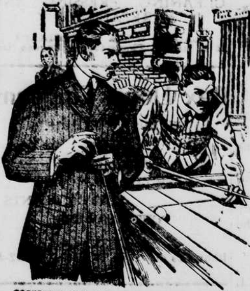
COPYRIGHT 1912, THE ROYAL TAILORS

THIS GARMENT IS GUARANTEED TO FIT YOU PERFECTLY