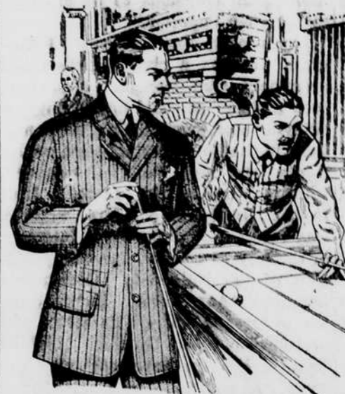
COPYRIGHT 1912. THE ROYAL TAILORS

Two hundred men were challenged to bring back their Royal Suits, if they did not fit and please in every respect. Not one of the 200 took advantage of the Guarantee on every garment.