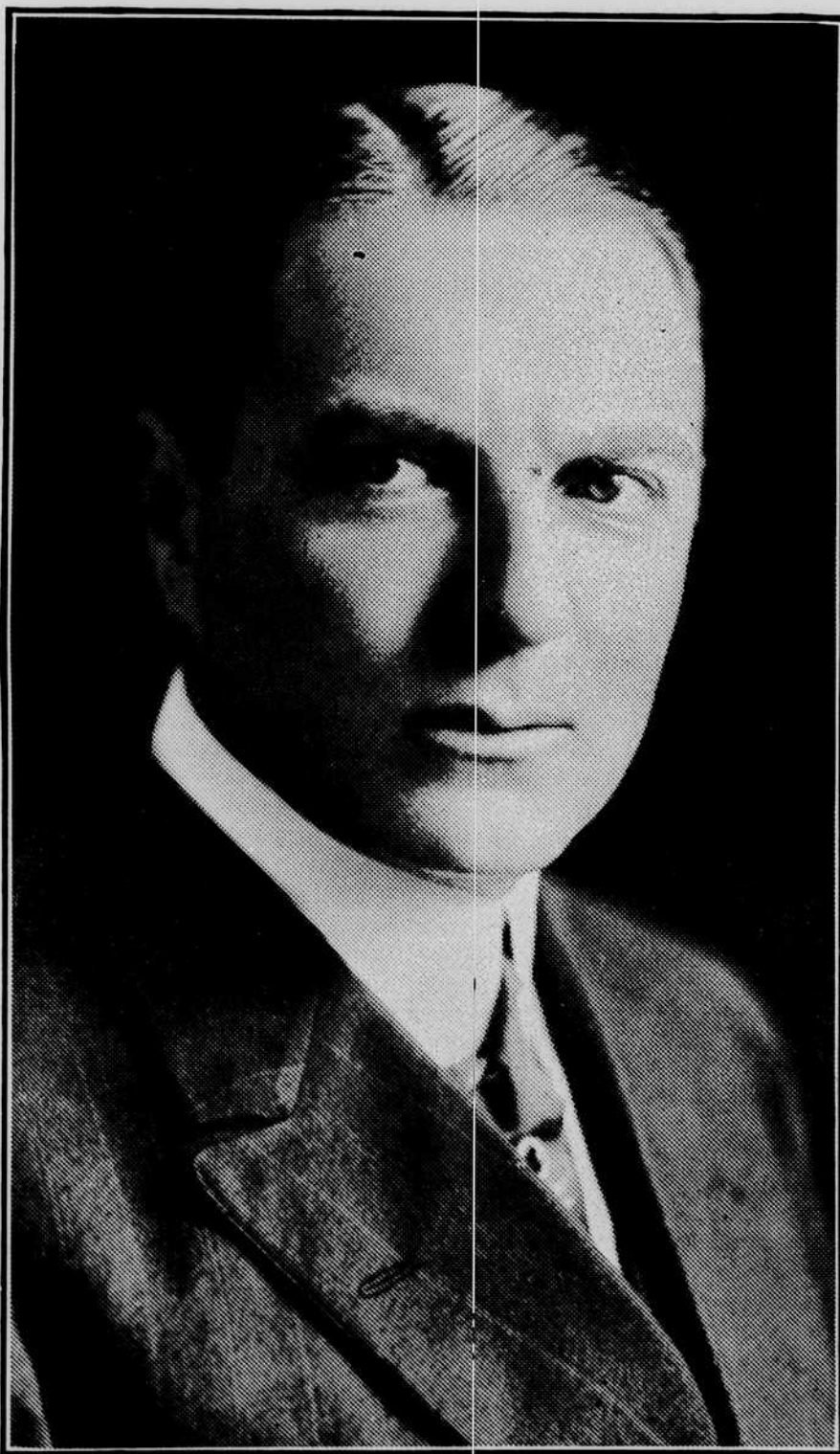
Holbrook Blinn, in "A Romance of the Underworld," at Eugene Theatre, Friday, November 22.

The Athletic Association at Michigan has voted to give soccer a try-out as a regular sport. An inter-class system of teams will be tried at first, and if this proves successful a college team will be organized and a schedule arranged.